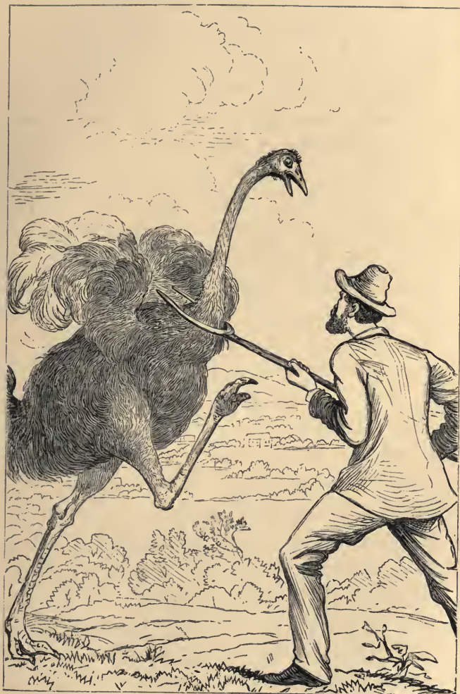
JONATHAN HOBSON'S FIGHT WITH AN OSTRICH.—PAGE 82.